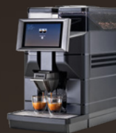
Magic B2 / B2+