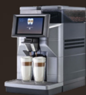
Magic M2 / M2+