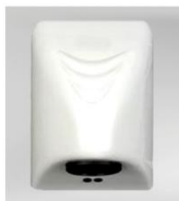
HAND DRYER SENSOR