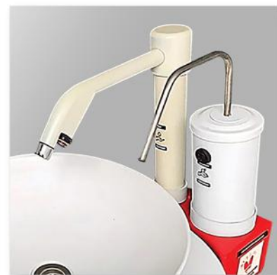
TAP WATER SENSOR