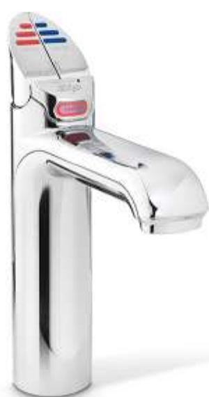
Model : HT1705