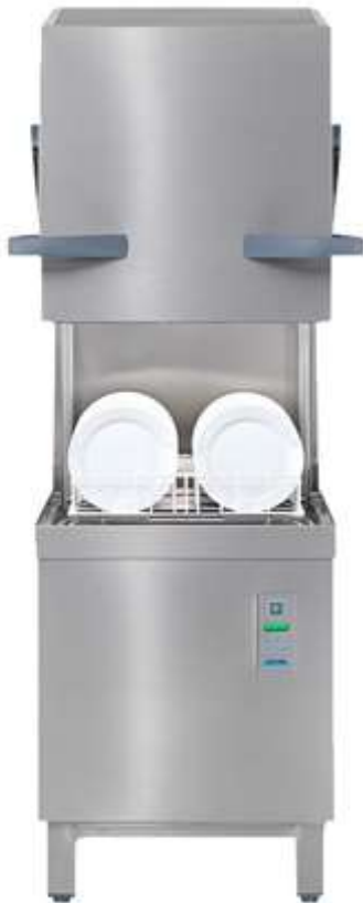
Model : PT-500