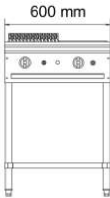
CRB 2BFS Front View