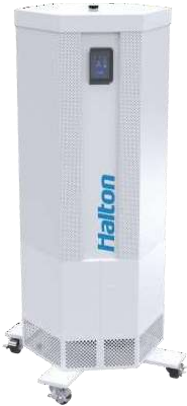
Model : UVGI-SA